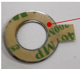
Double side tape on code wheel