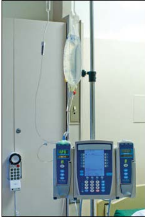
Large-volume infusion pump.

Closely related to the LVP is the syringe pump. This device presses the plunger of a large syringe at a precisely controlled rate. The infusion rate of these syringe pumps is generally orders of magnitude lower than that of LVPs. Aside from the pumping mechanism, almost all other aspects of syringe pumps are similar to LVPs.